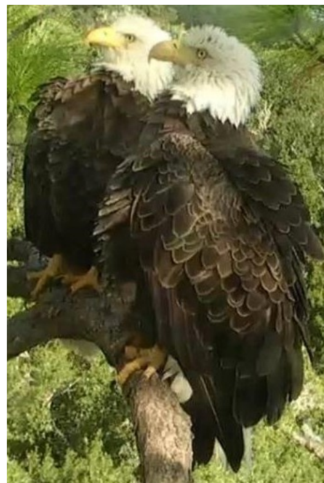
Romeo & Juliet (aka Mom & Dad)