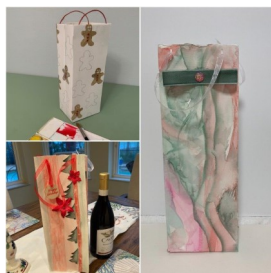
Fun Art, Gift Bag Project

At the same time, FCAL is featuring a new educational concept, "Art for the Fun of It." This is a program that emphasizes "fun" art rather than "fine" art. "We envision it as a way to connect all artistic levels together, rather than