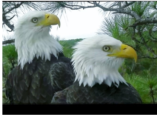
Romeo & Juliet

Eagles are also very graceful, focused hunters and appear almost effortless in their snatching of a fish from just beneath the water surface or from an osprey in flight! This approach is done with textbook precision. It is always a treat to view their "catch" and settle up on a branch enjoying their prize.