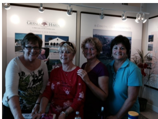
GH residents helping to pack boxes to be shipped