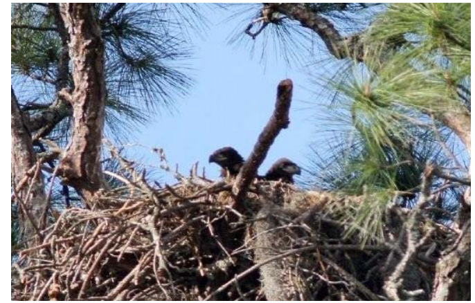
Two eaglets in their nest.

According to Butler, two hatchlings were born Jan. 2 and 3 and were spotted making their first solo flights March 20. While one of the youngsters managed a successful first flight, the other looked more like a feathered rock as it fell from the nest tree and wandered through the dense preserve for the night. Both eaglets later reappeared in the nest and by early April, were improving their flying skills.