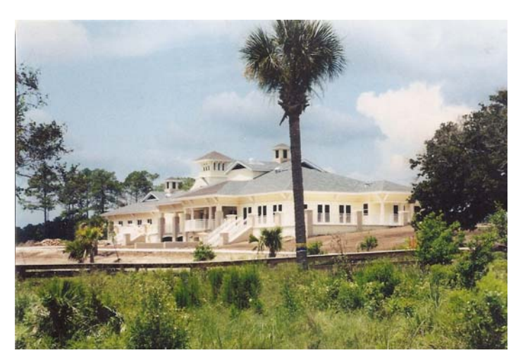
The new clubhouse, prior to its August 2002 opening.