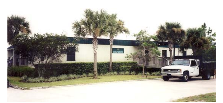
The triple-wide trailer used as a clubhouse from the spring of 1998 until the opening of the clubhouse in August 2002. Early members recall the triple wide with fondness.