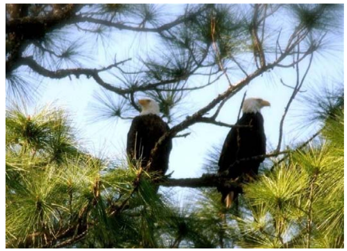
Wild Oaks eagles in their tree top home.

The nest is atop a 75-foot pine tree visible from the path leading to the dog park. To view the nest, after entering the village, turn right and then make the first left. The area is roped off to prevent disturbing the eagles. According to the U.S. Fish and Wildlife Service, disturbances anytime during the nesting season could lead to abandonment of the nest or the young. Viewers are advised to walk slowly, talk softly and act as if "you could easily frighten these beautiful birds away because you could."