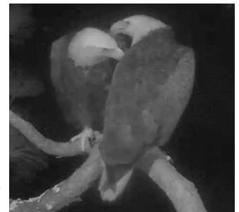
Samson & Gabby sleeping

Samson and Gabby are a sweet pair and seem inseparable. They are usually seen together on-site and off-site. They roost together most every night either at the nest or very close by. By observing closely, there is every reason to believe they are both first breeders (positively for Samson knowing his age). By observing Gabby's plumage change over the past year, it appears they are close in age. They have mated numerous times. The female is typically only fertile approximately two weeks in a season, so their copulation needs to be timely and accurate. For new breeders, this is a balancing act and quite challenging!