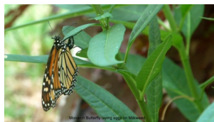
Monarch butterfly laying eggs on milkweed

Plant these natives along with milkweed to provide nectar to monarchs: Blazing star, Cat's tongue, Chaffhead, Climbing aster, White crownbeard, Flattop golden rod, Golden rod, Mistflower, Scorpiontail, Spanish needles, Yellowtop